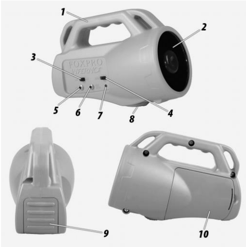
Table 1: Inferno Overview

The images below, and their corresponding charts, highlight notable elements of the Inferno game call and remote.