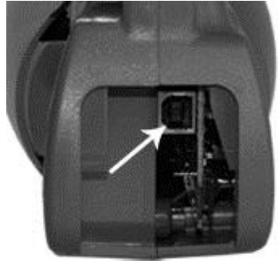
Figure 2: Inferno USB Port

The USB port is located inside the back access compartment (see Figure 4 to the right) of the Inferno. Make sure the Inferno is powered off while it is connected to your computer. After connecting the Inferno to your computer, launch the utility. The utility should recognize the device and display "Connected to..." followed by the device name. The "Caller Sound Files" column will become active and display the sounds currently installed.