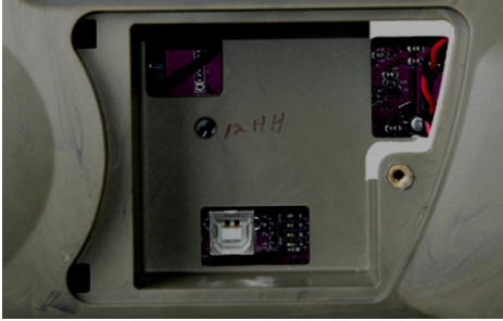
VERSION B (FIGURE 2)